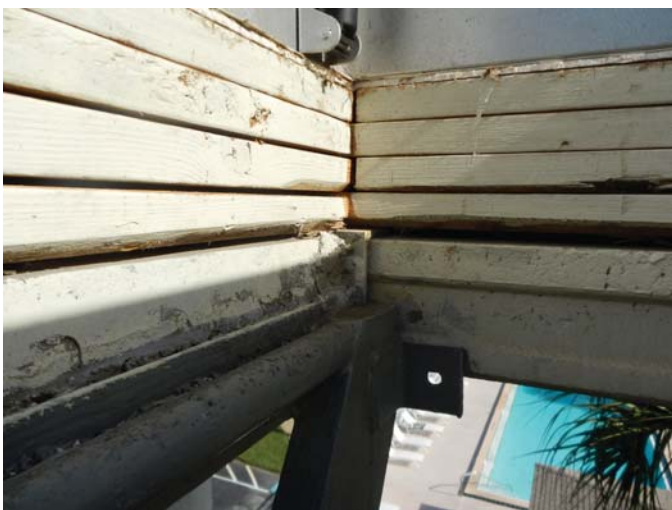
Reinforced Concrete Decking