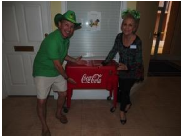
The free beer disappeared quickly