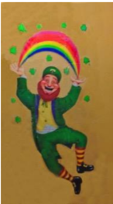
The Irish Jig