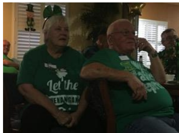
The Mervis family dressed for the occasion