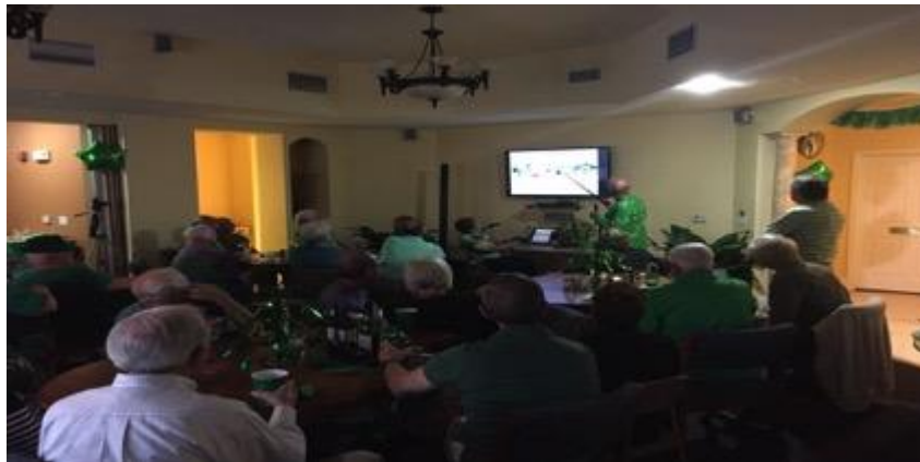
The audience sits in rapt attention