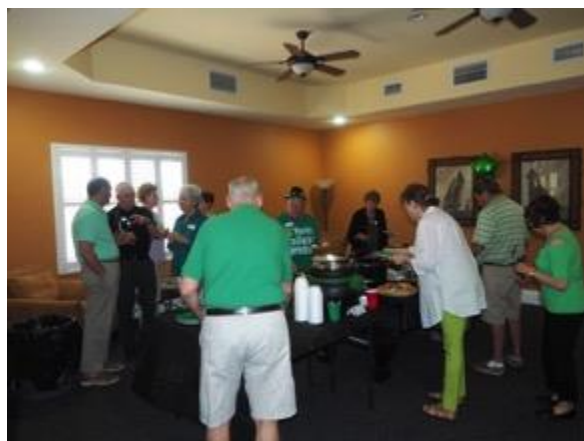
At the feeding trough