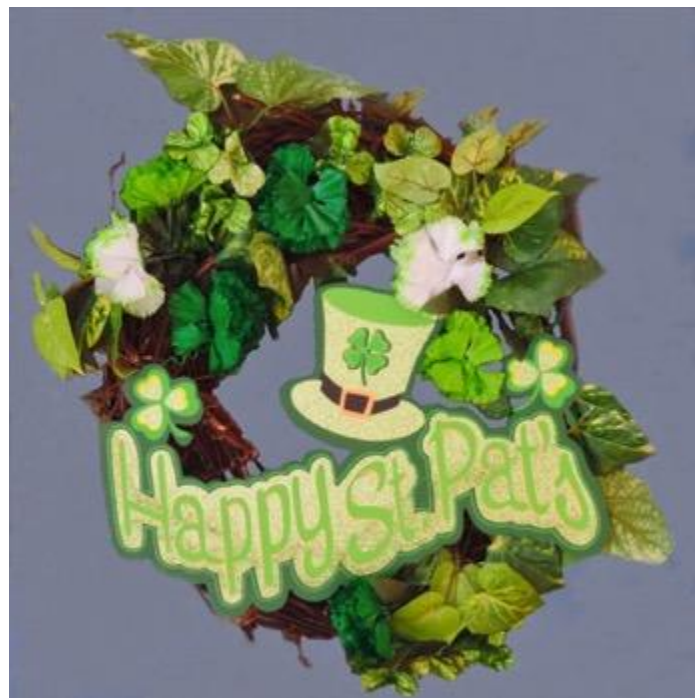
Happy St. Patty's Day!!