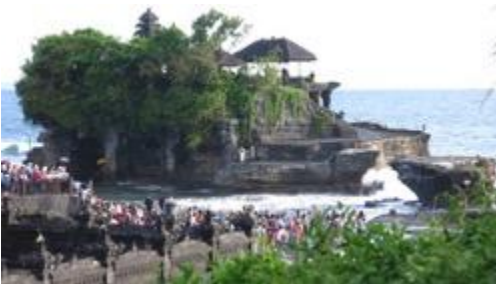
Tanah Lot, Hindu Temple, Bali