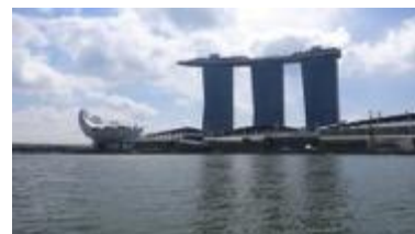
Marina Bay Sands Hotel