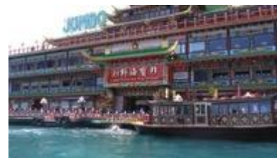
A real Chinese restaurant