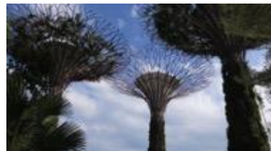
Gardens by the Sea