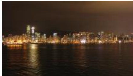
Hong Kong Harbor