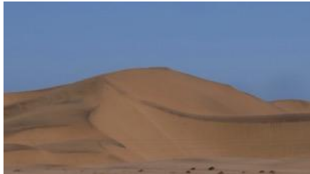
Dune #7, 426 feet high, Namibia