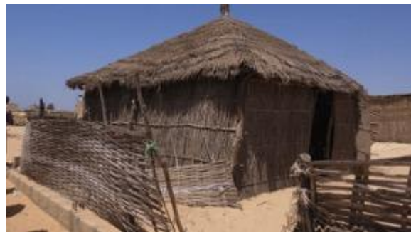
How the African farmers in Senegal live