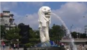
Merlion of Singapore