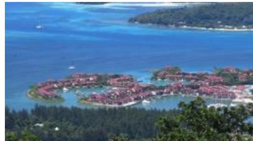
The Seychelle Islands located off the coast of Somalia, Africa in the Indian Ocean