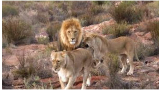
Safari at Aquila Game Reserve