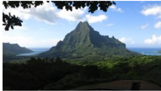
Moorea, French Polynesia (where Tom tried to abandon ship)