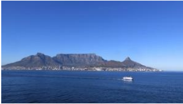
Cape Town, South Africa