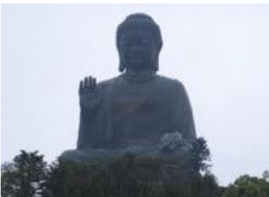
Po Lin Monastery, Hong Kong