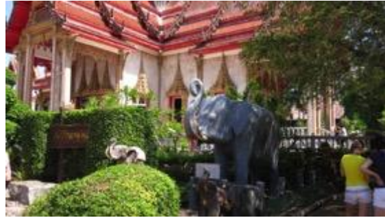
The Sacred Elephants and Wat Chalong Temple, Phuket, Thailand