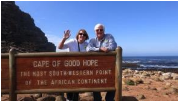
The Jensens at Cape of Good Hope