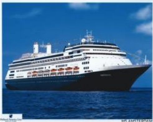
The MS Amsterdam (our home for 4 months)