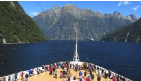
Milford Sound, New Zealand