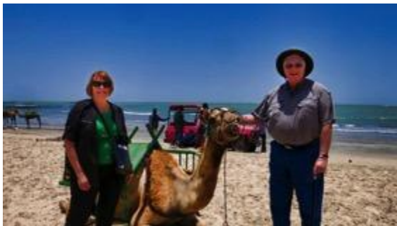
A camel ride in The Gambia