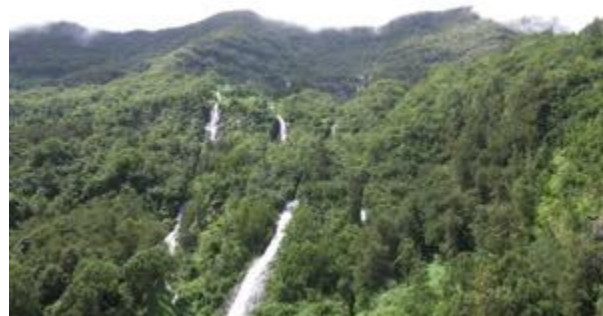
Reunion, a French protectorate (located east of Madagascar in the Indian Ocean)