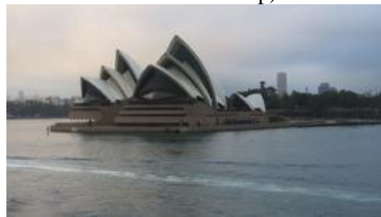
Opera House, Icon of Sydney, Australia