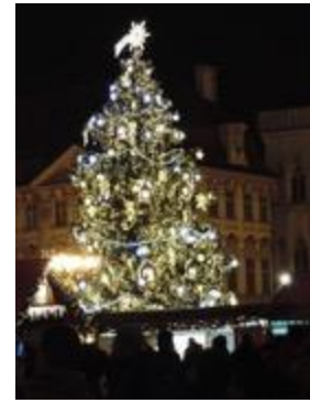
Old Town Square in Prague, the tree in the main market and a sample of a Christmas decoration and the weather we experienced.