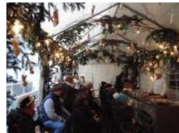
In Linz, Austria: hot eggnog (you have to ward off the chill!), street decorations and a gingerbread making demonstration.