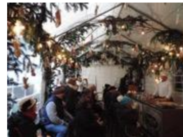
In Linz, Austria: hot eggnog (you have to ward off the chill!), street decorations and a gingerbread making demonstration.