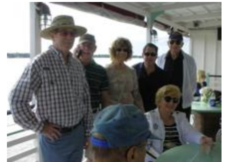
Photos courtesy of Donna Meligi (Suite PH-02) and Stan Bowers (Suite 606)